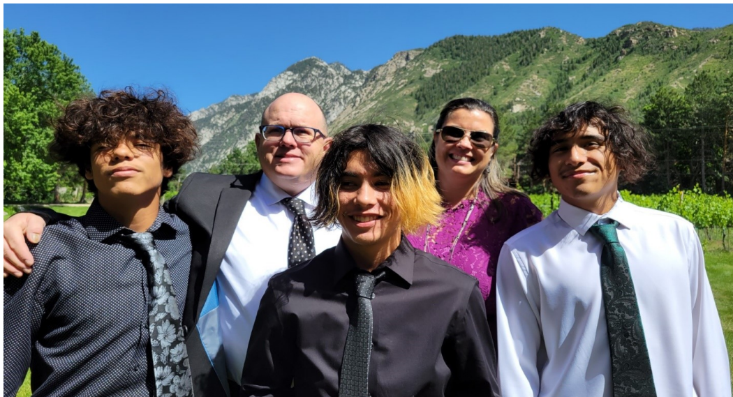
Photo taken in Utah at a recent family wedding.