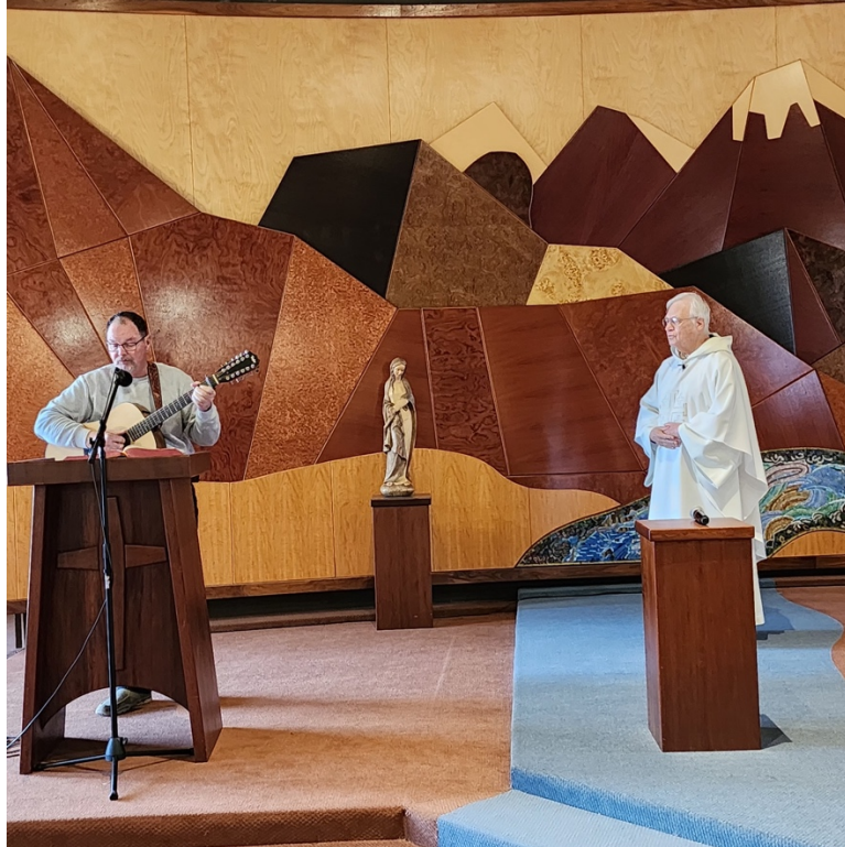
Group photo January 2024 Men's Retreat